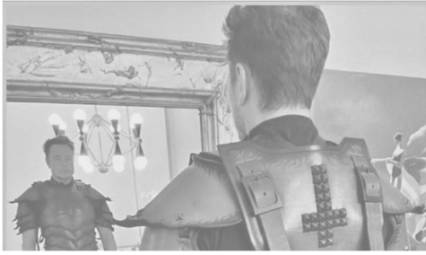
Musk dressed as the demon Baphomet in 2022, with upside down crosses on his back and over his heart.